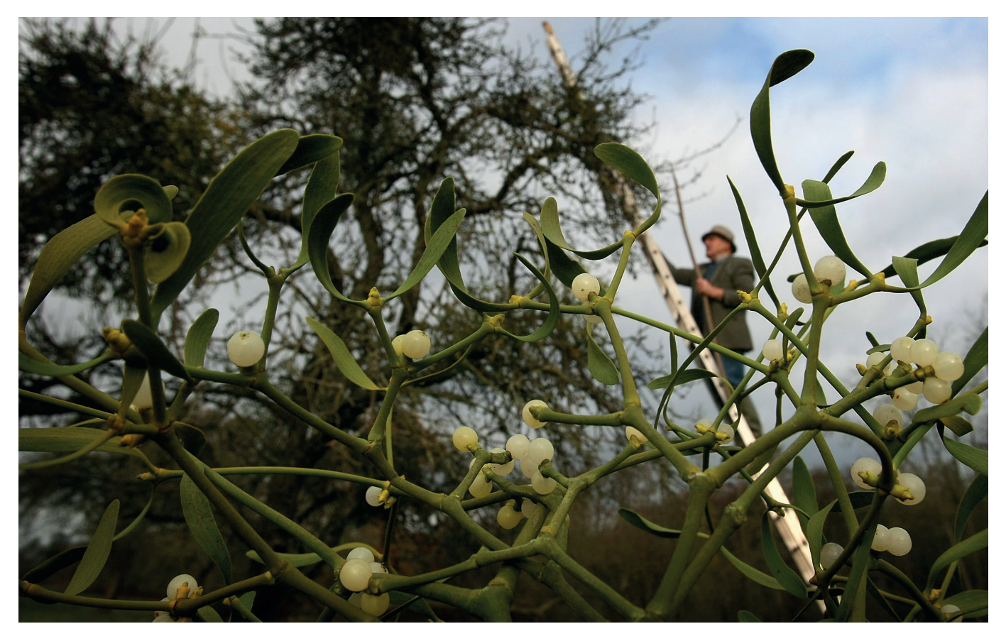
ABOVE: A farmer harvests a crop of mistletoe from his apple trees in Tenbury Wells on the Worcestershire/Herefordshire border. BELOW: A man tries to kiss a shy young woman under a sprig of mistletoe, from The Graphic Christmas Supplement , 1887.

cate to form V-shaped pairs, like a pair of man's legs. Growing from the centre of the V are the white, sticky berries, which commonly grow in pairs and could be thought to resemble unfeasibly large testicles. This does not sit well with the tradition of kissing under the mistletoe, since a berry must be removed with each kiss. And what do larger clusters of berries symbolise? Unfeasibly large hæmorrhoids, perhaps?