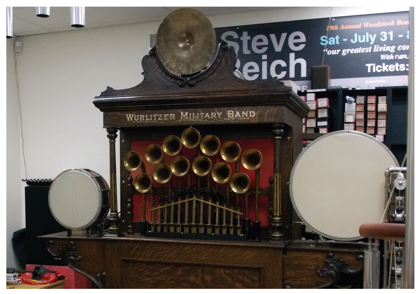
ABOVE: The Wurlitzer Military Band; not heard at its best on this occasion. BELOW: The Unaphon, with its vibrating metal plates played from a tiny keyboard.

instruments to a large rectangular stand hung with aluminium tubes of different sizes. Most were suspended vertically; at the bottom were two huge horizontal tubes. On a table to the side was an assortment of soft percussion mallets in various sizes.