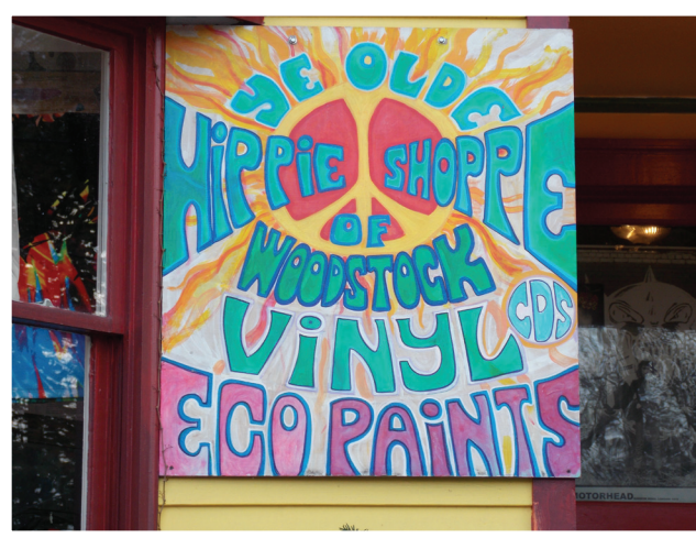
ABOVE: Welcome to Woodstock – just like any other small New England town, apart from the rainbow-coloured shops selling crystals, candles and cake.